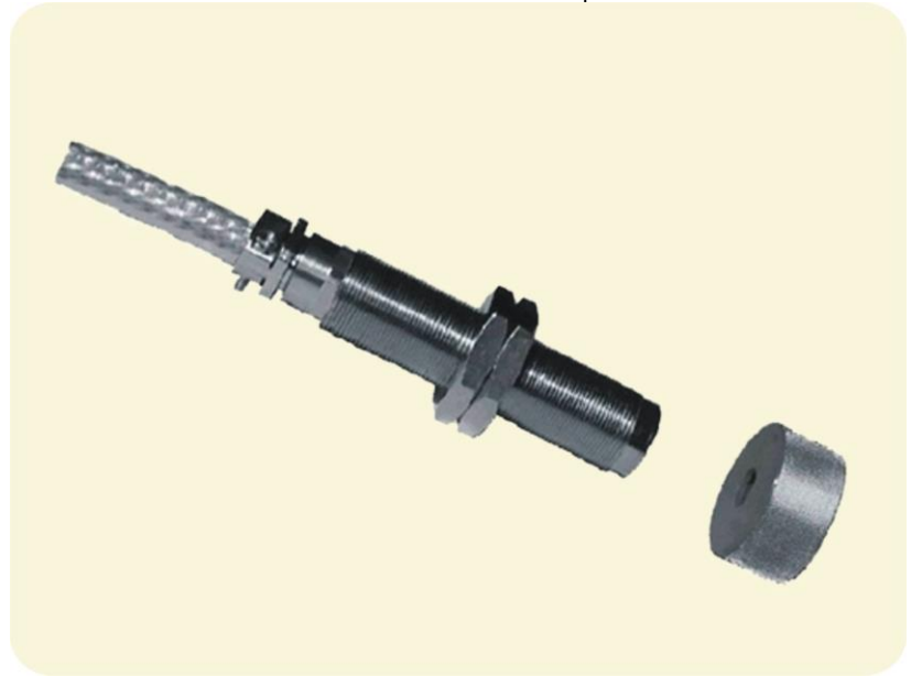
Magnetic proximity switches for heavy industry

MHM sensors detect a variation of the magnetic field and are used in conjunction with a magnet. They can detect magnetic objects through non-magnetic material or the magnetic field can be transmitted away from difficult environment by using magnetic conductors.